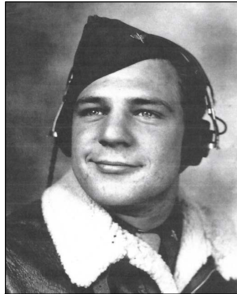
WWII Distinguished Flying Cross Recipient 1 st Lt. Ray LeDoux

Flight crews routinely overcame incredible obstacles like this every day. Even when given a few "flak days off", they were back flying missions when the call came for every available plane for bombing flying missions. A high percentage of these crews had "less airfield landings than takeoffs" due to being shot down, bailing or ditching in the English Channel. It was not unusual to get fished out of the Channel and be back flying the next day.